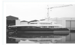
Heesen Delivers 4YOU In "Motoryachts"

FEATURED POSTS, TENDERS, TOYS, & PRODUCTS, YACHTS V-TECHNOLOGY. PERMALINK.