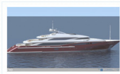
ISA Inks Largest Yacht to Date In "Builders"